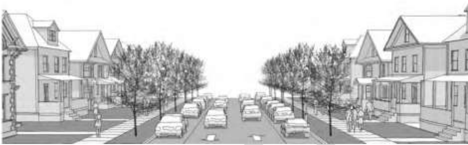
*Example Street Section, Source: City of Buffalo, NY - Unified Development Ordinance

**All parking spaces shall comply with parking space dimensions in Parking Section.